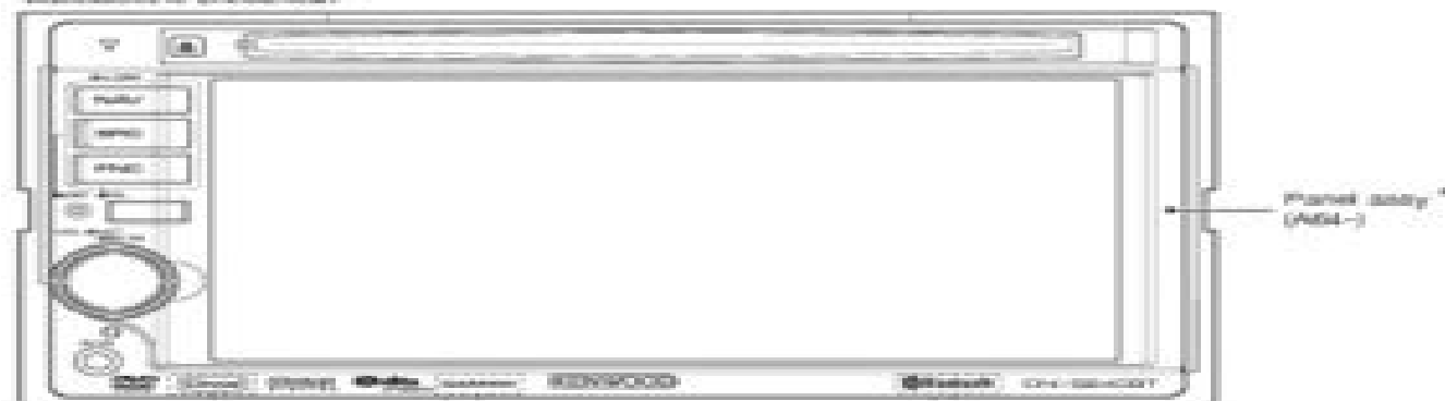
Illustration is DDX5240BT

© 2006-11 PRINTED IN JAPAN B53-0693-00 (N) 429