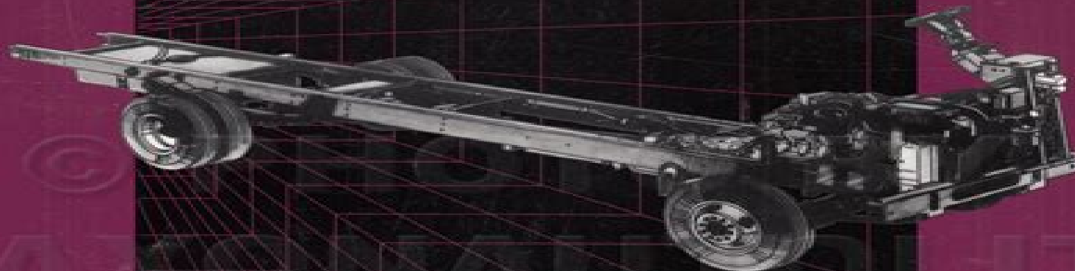
Class A Motorhome