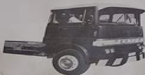
FIG. 2. ERF 1000