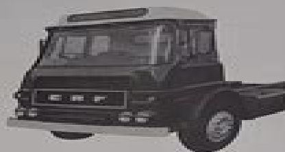
FIG. 1. ERF 1000