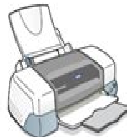
Figure 1-1. Stylus PHOTO 890