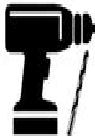
Drill (ø8mm / 5/16 in)