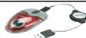
Mobile Products & Cables