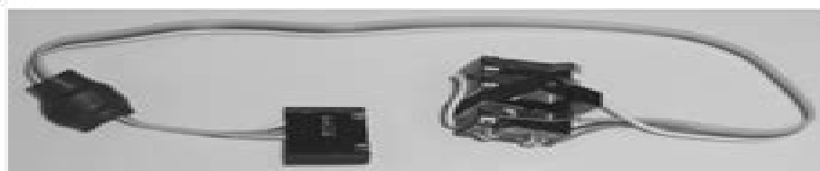
Figure 1 – Shunt Switch Assembly (P/N M42408)