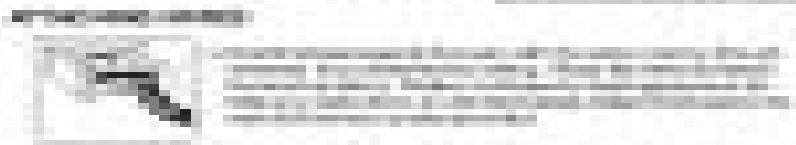
Figure 1 and 2: Schematic diagrams of building structural systems showing different core and column arrangements.