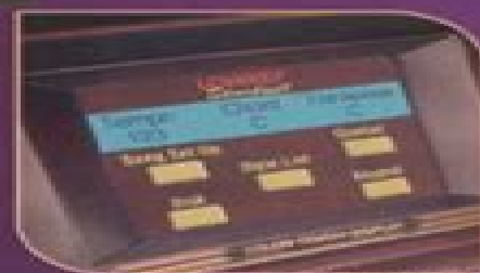
Color Touch Display