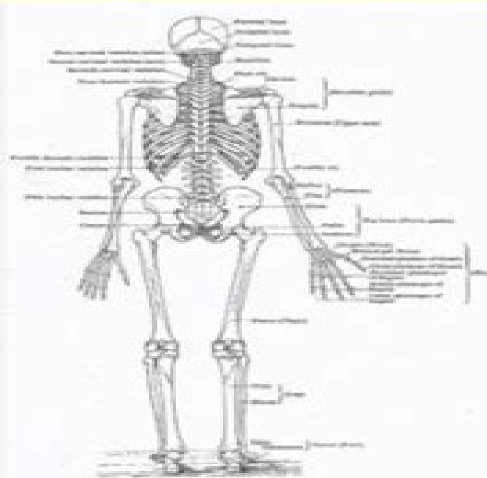
FIG. 12-1. Posterior view of the skeleton of a man. The bones of the left femur will be used in the position of position.