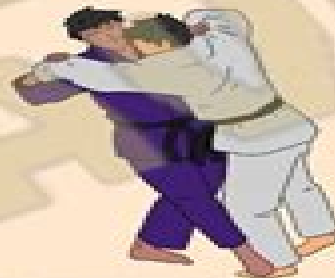
SASAE TSURIKOMI ASHI (支釣込足)