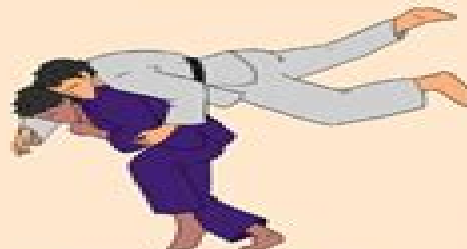
IPPON SEOI NAGE (一本背負い投げ)