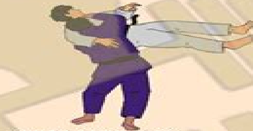
USHIRO GOSHI (後腰)