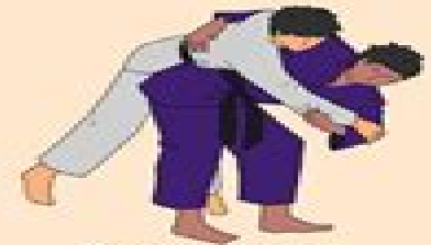
Ō GOSHI (大腰)