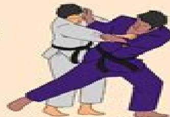
TAI OTOSHI (体落)