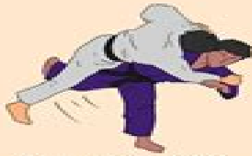
UCHI MATA (内股)