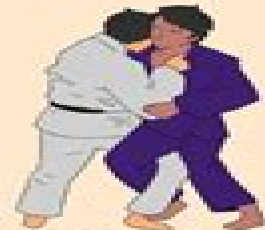
KOSOTO GAKE (小外掛)