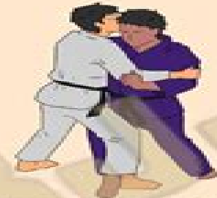
KOUCHI GARI (小内刈)