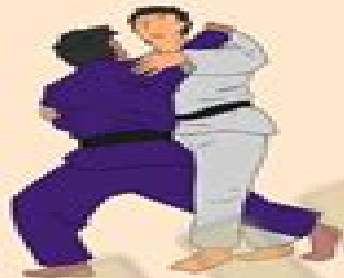
ŌUCHI GARI (大内刈)