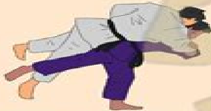
HARAI GOSHI (払腰)