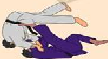
TOMOE NAGE (巴投)