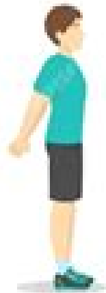
5 CHEST STRETCH