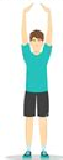
4 OVERHEAD STRETCH