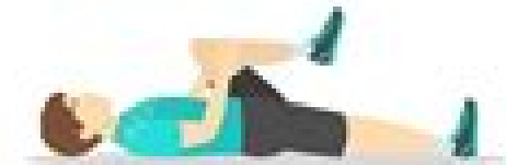
11 THIGH HUG