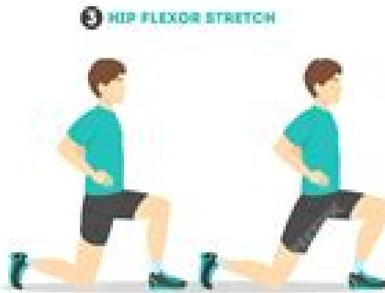
3 HIP FLEXOR STRETCH