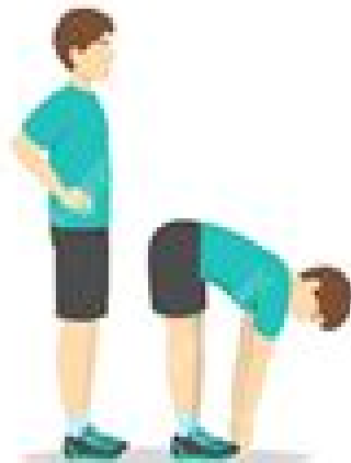
6 FORWARD BEND