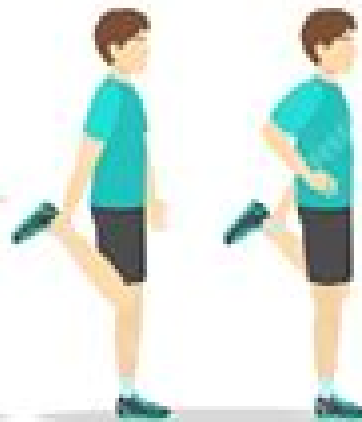
8 QUADRICEPS STRETCH