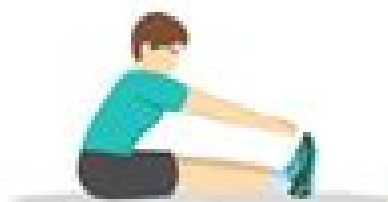
7 TOE TOUCH