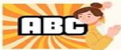
WORD SCAVENGER HUNT