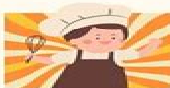
ENGLISH COOKING CLASS