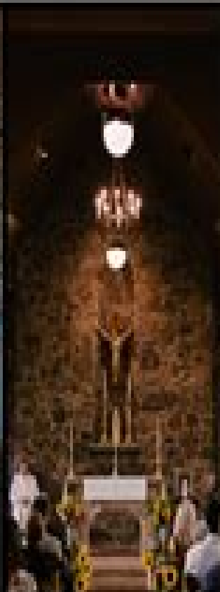
A MYSTICAL COMMUNION