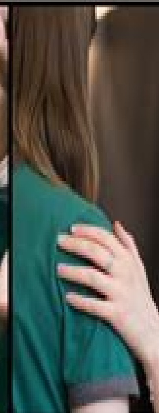
A COMMUNITY OF DISCIPLES