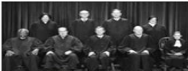
The nine current U.S. Supreme Court Justices.

At the U.S. Supreme Court, a panel of nine justices hears the cases. (State supreme courts often have fewer justices.) The Supreme Court gets to choose which cases to take — and it doesn't take very many! Often, cases that make it to the Supreme Court are disputes about whether a law goes against the Constitution. Once the Supreme Court has said something is unconstitutional, that's it! Only the Court itself can reverse that decision. This power of deciding what is constitutional is called judicial review . The U.S. Supreme Court has this power over federal laws. State supreme courts have this power over state laws.