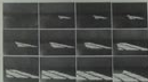
The Shades in My Studio 1998

Black and white photograph and print on paper 2011 x 2011