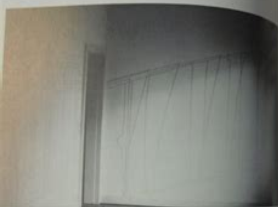
Shades Turned off as a Museum Room Lamp and 1997