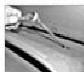
11.46b Then remove the four upper retaining bolts

42 Under the four outer mounting bolts from the face on both sides (see illustration).