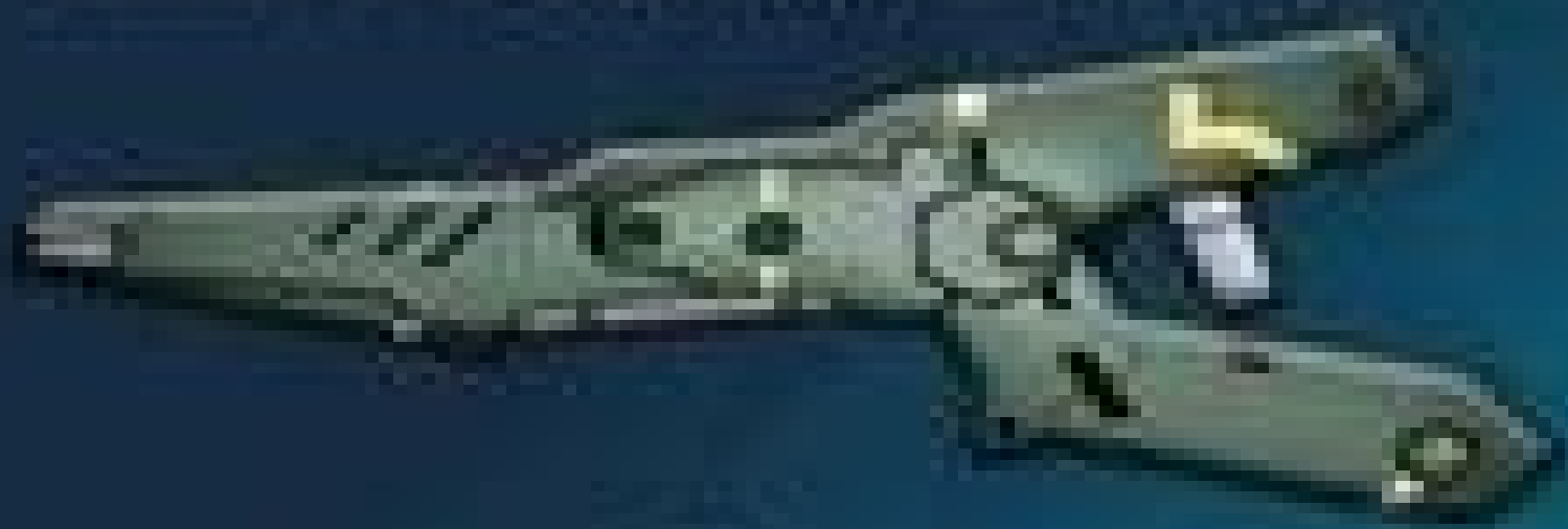
Figure 10.11: A pair of scissors, a pair of pliers, and a pair of tongs.

Figure 10.10: A pair of scissors, a pair of pliers, and a pair of tongs.