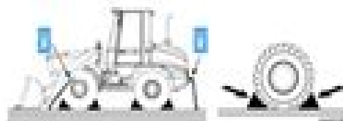
Fig. 355 Loading points