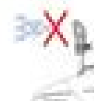
Fig. 357 Blocking off the exhaust pipe opening