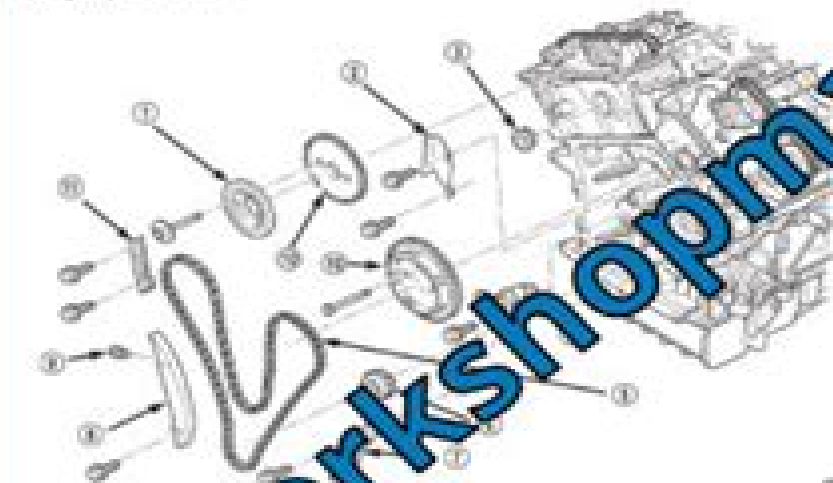
Fig. 59 Primary Timing Drive System 1 - CRANKSHAFT DAMPER 2 - CRANKSHAFT SPROCKET 3 - CRANKSHAFT SPROCKET 4 - CRANKSHAFT SPROCKET 5 - CRANKSHAFT SPROCKET 6 - CRANKSHAFT SPROCKET 7 - CRANKSHAFT SPROCKET 8 - CRANKSHAFT SPROCKET 9 - CRANKSHAFT SPROCKET 10 - CRANKSHAFT SPROCKET 11 - CRANKSHAFT SPROCKET 12 - CRANKSHAFT SPROCKET

(4) Install rocker arm in original position (if reused) over valve and lock adjuster. Release tension on valve spring.