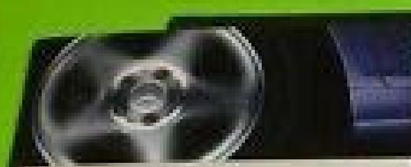
Spare and Wheel Information (TMD Page 10)