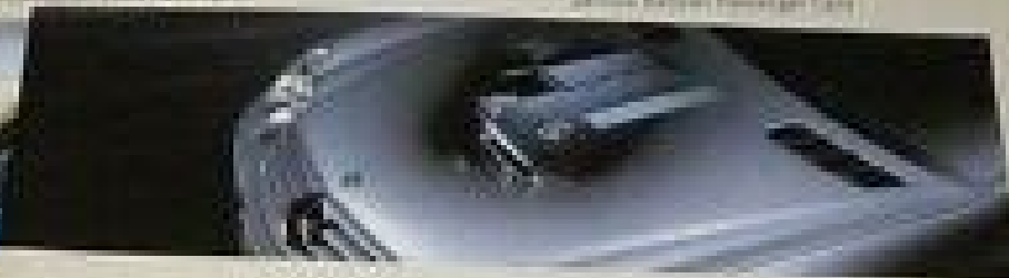
Factory Approved Service Products (December 2000)