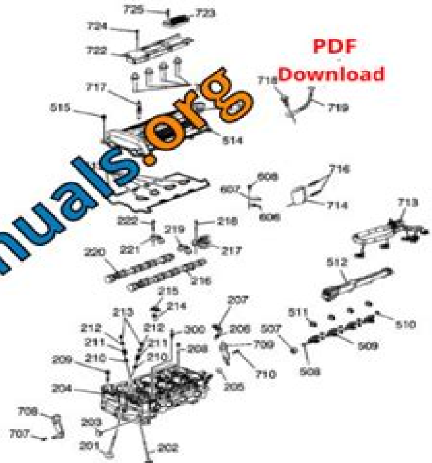
Fig. 18: Disassembled View Of Cylinder Head and Components Courtesy of GENERAL MOTORS CORP.