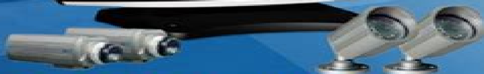
Two Indoor & Two Outdoor Night Vision Cameras