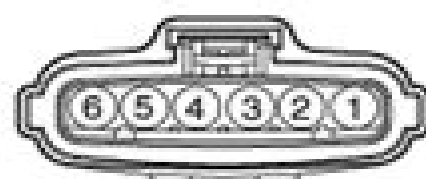
C222 ETC Module