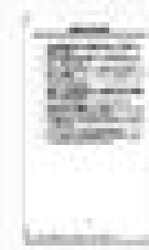
ILLUSTRATION 1: A RETRACTABLE TRIMMED PLATE IS POSITIONED AROUND THE DISPLAY SCREEN WHICH LIGHTS UP WHEN A FUNCTION IS ACTIVE (FOR EXAMPLE CD, RADIO OR AUX.)