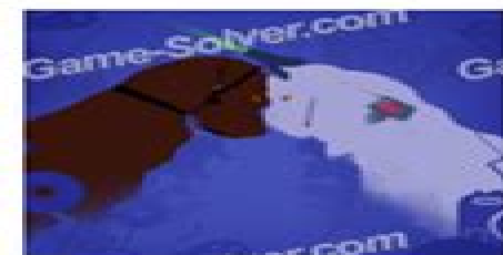
Cats & Dogs