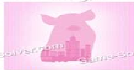
Babe Pig In The City