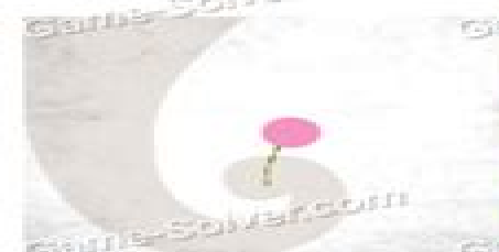
Horton Hears A Who