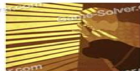
Turner & Hooch