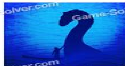
The Water Horse