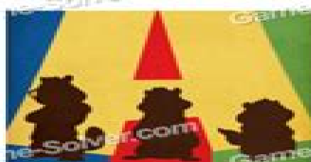
Alvin And The Chipmunks