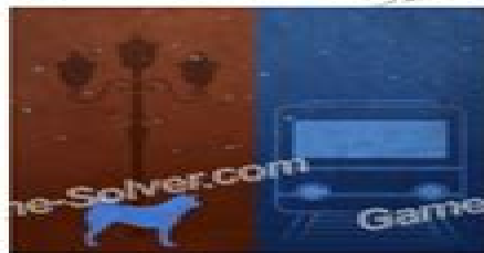
Hachi A Dogs Tale