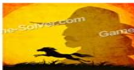
Spirit Stallion Of The Cimarron