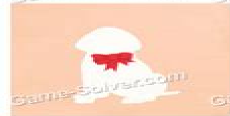
Marley & Me