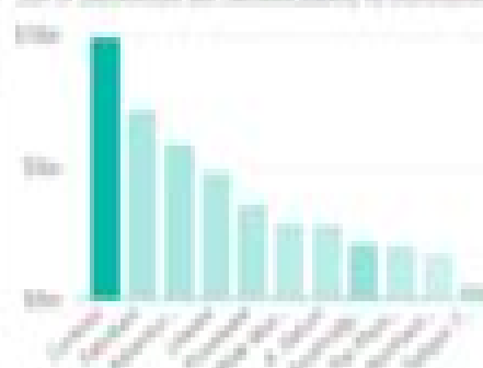
Total of Sales/Revenue and Discount/Quantity by Month/Year