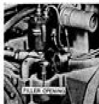
Crankcase Filter Opening

After draining crankcase and removing old oil filter element, replace oil filter cap, pour 1 gallon of flushing agent into the crankcase, run the engine for a few moments, then drain.