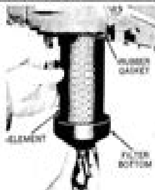
Oil Filter Element

After flushing agent has drained out thoroughly and a new oil filter element has been installed, remove the filter cap and pour new oil of the proper weight in filter opening, until the oil is up to the "FULL" level on the dip stick with cap resting on top