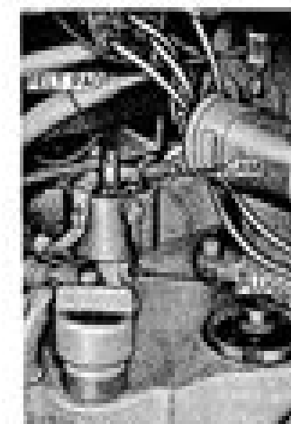
Points of Distributor Lubrication

For lubrication of the distributor shaft, see page 74.