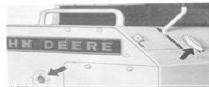
Fig. 8-Hydraulic System Oil Level Window and Latch

Check oil level in loader hydraulic system. Oil level should be halfway up in oil level window with the bucket rolled back on the ground.