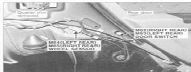
M52, M53, M54, M55