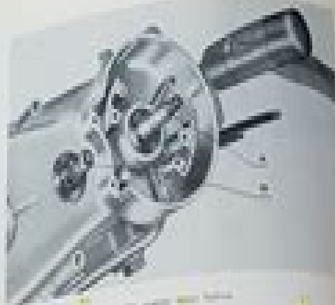
Fig. 1. View of the engine from the side.