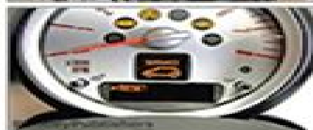
Step-by-step instructions for resetting CBS service lights, 600 Maintenance