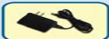
5V 2A DC Power Adapter