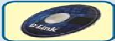
CD-ROM with Manual