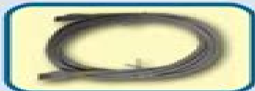
Ethernet (CAT5e UTP/Straight-Through) Cable