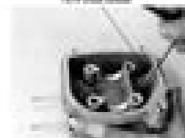
Valve Guide Removal