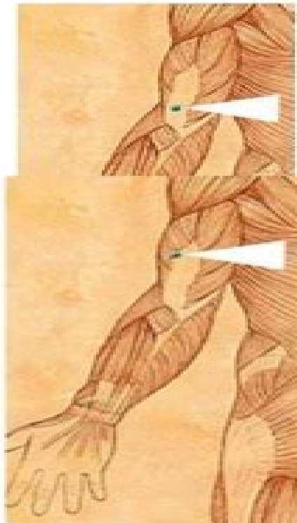
Punto 12 (TB-

Situado en la cara punto se través del biceps.