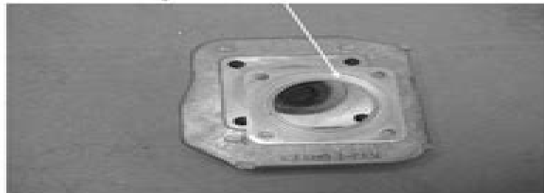
Cylinder head Gasket

Install a new cylinder head gasket onto the cylinder.