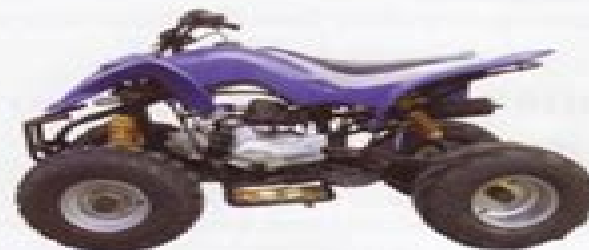
Falcom 90-4SAR, 100-4SA, 110-4SAR