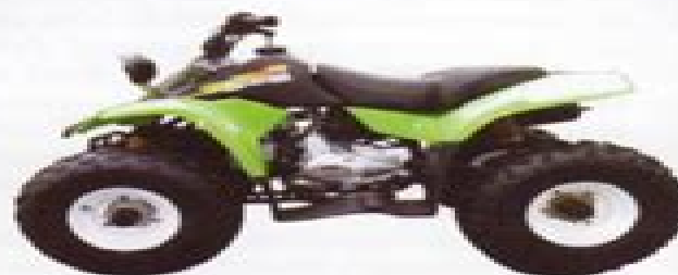
Panda 90-4SAR, 100-4SA, 110-4SAR