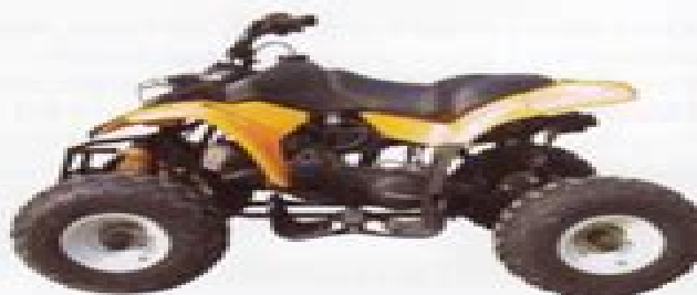
Lacoste 90-4SAR, 100-4SA, 110-4SAR