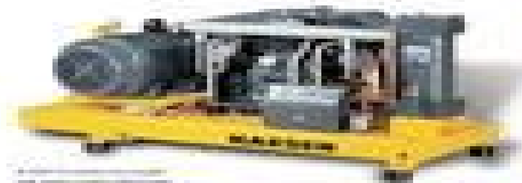
200-watt extra pressure booster with 200-watt motor