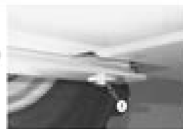
1—Drain Plug 2—Fill Plug