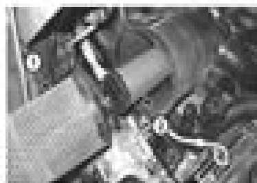
1—Primary Element 2—Secondary Element

Do not start engine without both the primary and secondary filter elements installed.