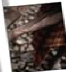
Portrait of the 'Red' woman, featured in