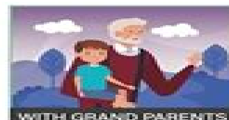
WITH GRAND PARENTS