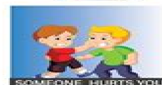
SOMEONE HURTS YOU