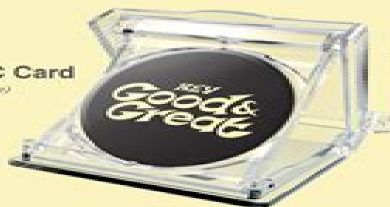
Music NFC Card 25.7 (mm)