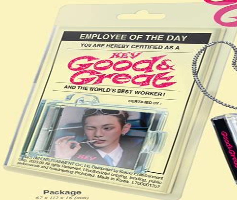
Package 67 x 112 x 16 (mm)