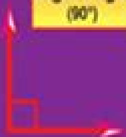
Right Angle (90°)