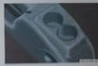
The Shifter is the center console. Press Shifter (1) - See top button when set.

⚠ Risk of injury! Always use proper technique for the vehicle's intended use. Always use proper technique for the vehicle's intended use. Always use proper technique for the vehicle's intended use.