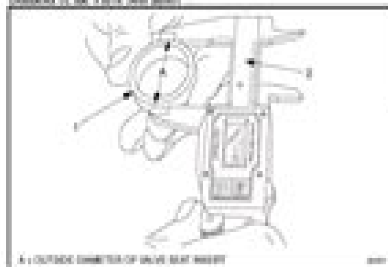
1. Valve Seat Inset 2. Measuring Device