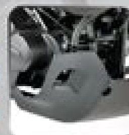
Protector de motor