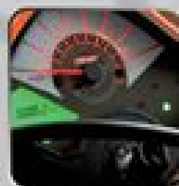
Tablero analógico digital