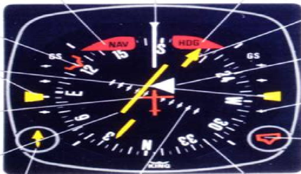
Heading Select Knob