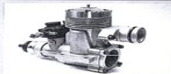
Nicely proportioned and sturdy looking, the 61-RE is largest, most powerful Irvine.