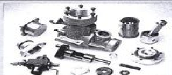
Parts of Irvine 61-RE. Engine uses investment casting for many components.