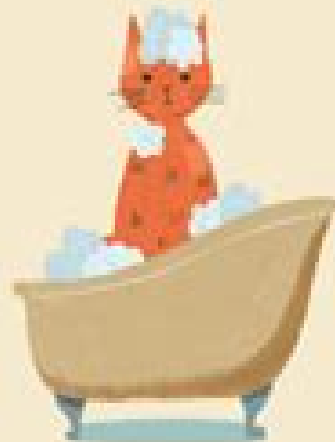
How to bathe a cat