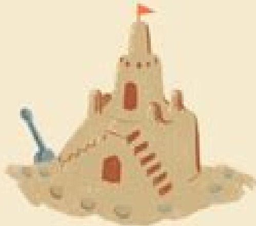
How to build a great sandcastle