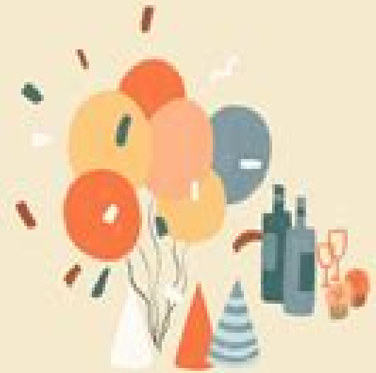
How to plan the perfect party