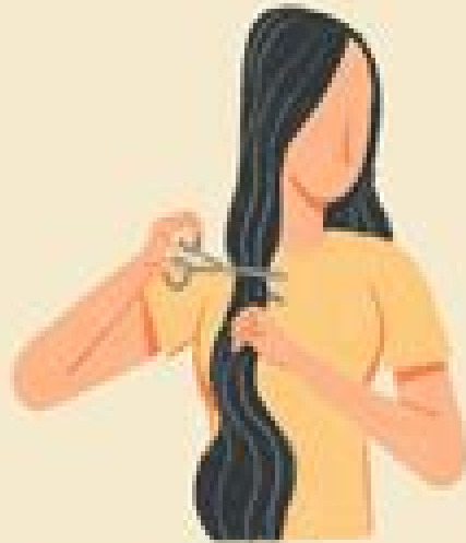
How to give yourself a haircut