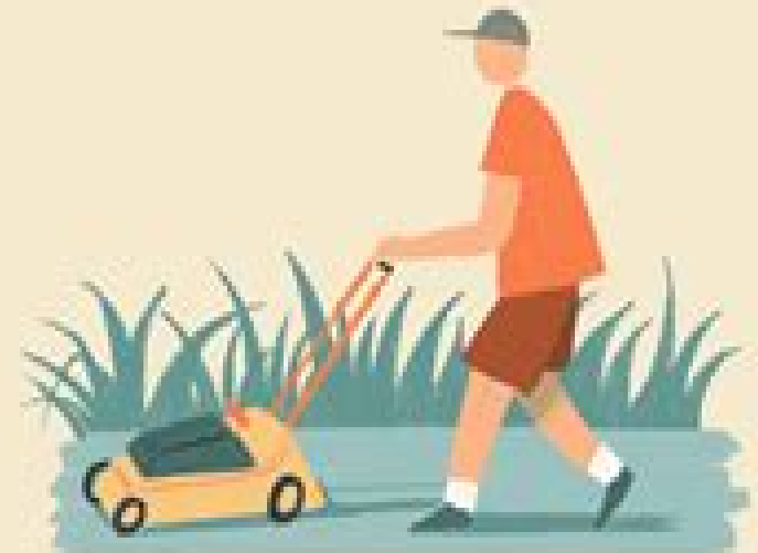
How to mow your lawn