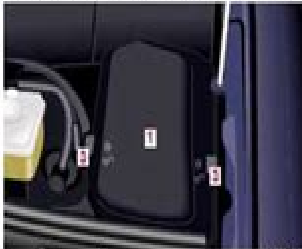
1 - Fuse box in engine compartment, left-hand side 3 - Tabs